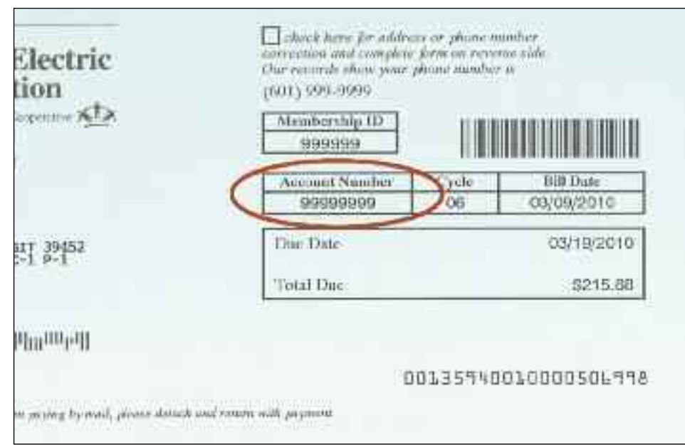
Singing River Electric members will be given a new account number as part of the cooperative's new software conversion. Members will need the new account number to pay bills beginning Monday, April 12. The account number is located in the upper right-hand portion of your billing statement. Please check for new account number beginning April 12.

On that date, members will be reassigned new account numbers. All payments made for bills dated Monday, April 12 or later must include the updated account number. New account numbers can be found on the member's billing statement beginning Monday, April 12. All online payments will need to set up a new user name and password with the new account number.