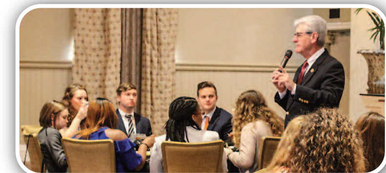
SRE's students were front and center when Gov. Phil Bryant spoke at lunch.