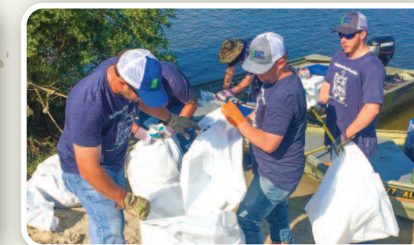
The 2018 Renew Our Rivers clean-up event at Gautier City Park collected six tons of debris, which was the year's most successful Mississippi Renew Our Rivers event.

Join us for the 2019 Jackson County Household Hazardous Waste Collection Event