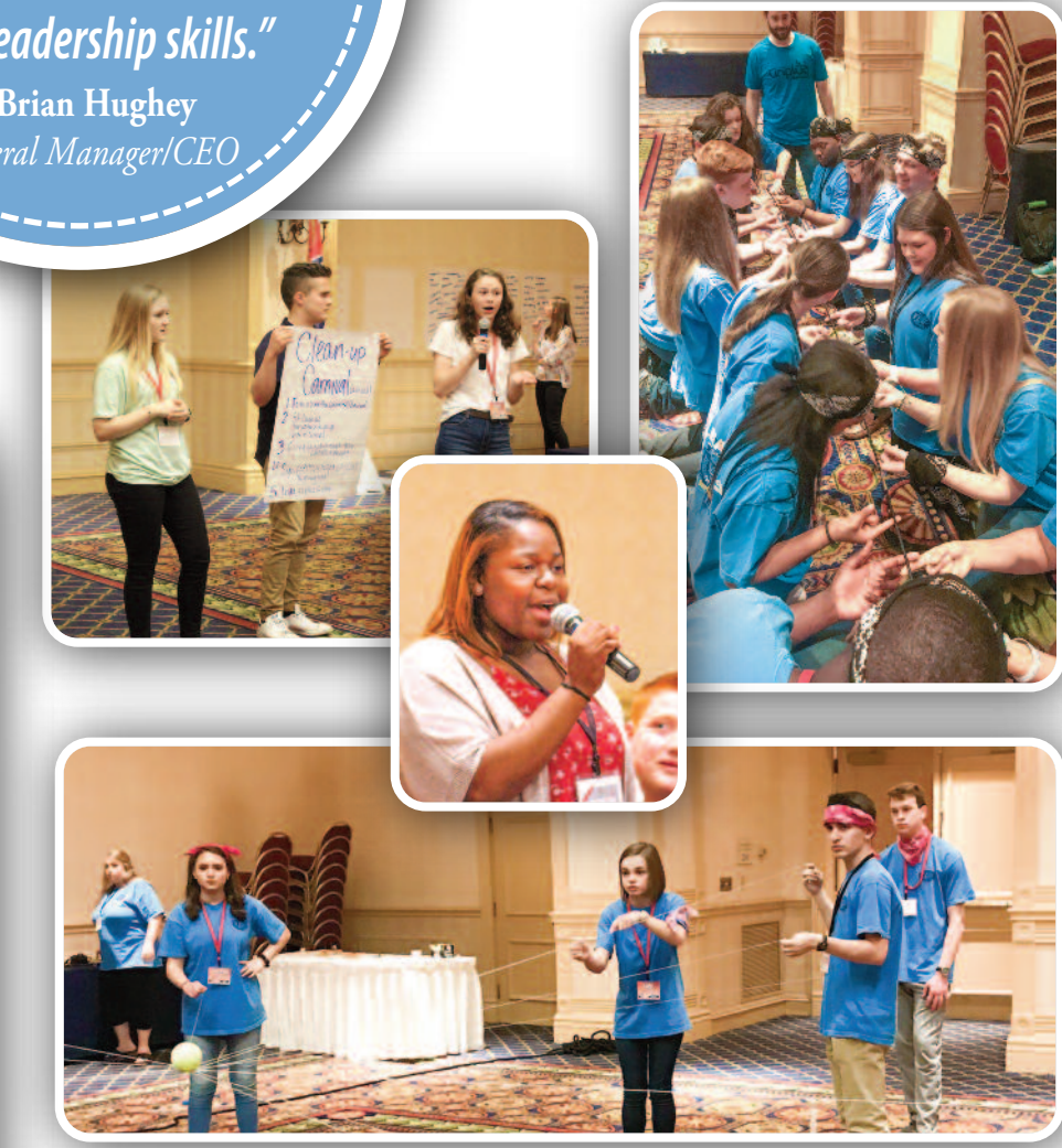
SRE's students used their problem-solving and leadership skills while interacting with fellow workshop attendees.