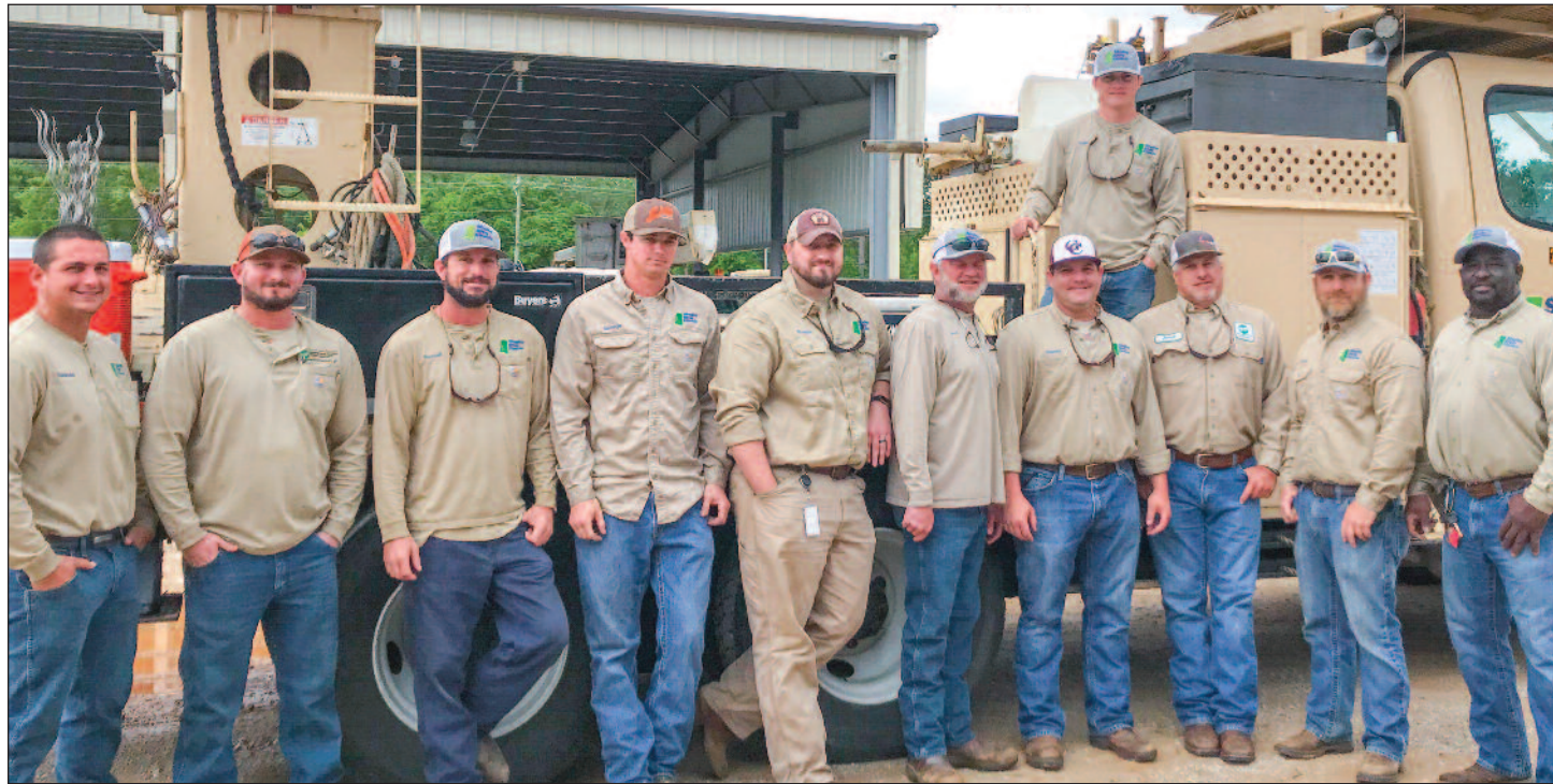
Members of the Singing River Electric team traveled to Puckett to help with tornado damage.

replaced several broken poles and picked up lines brought down by the severe weather. They returned home on the afternoon of April 20. Singing River Electric remains ready to answer the call of fellow electric cooperatives in need, as we live out the 6th Cooperative Principle: Cooperation Among Cooperatives.