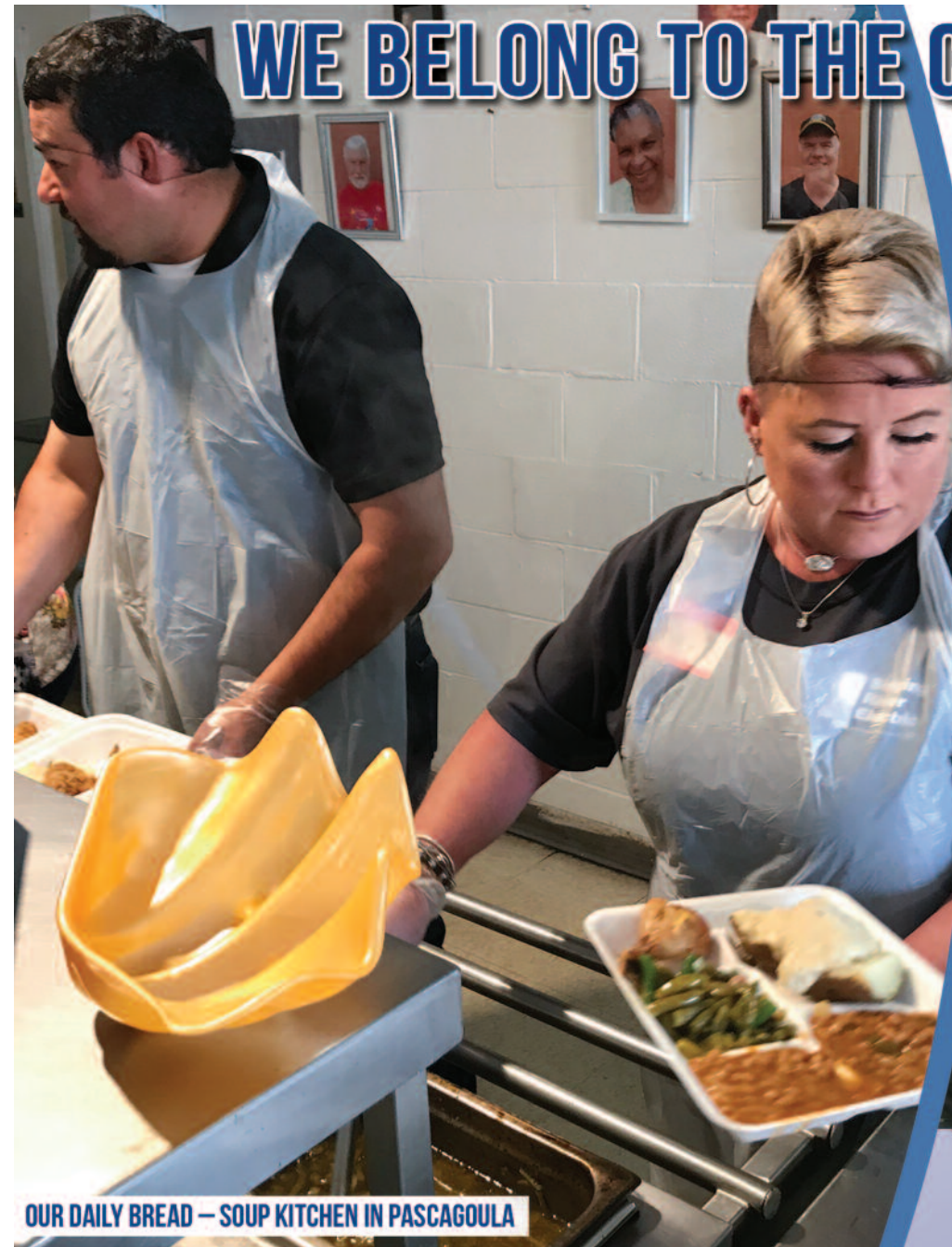
OUR DAILY BREAD - SOUP KITCHEN IN PASCAGOULA