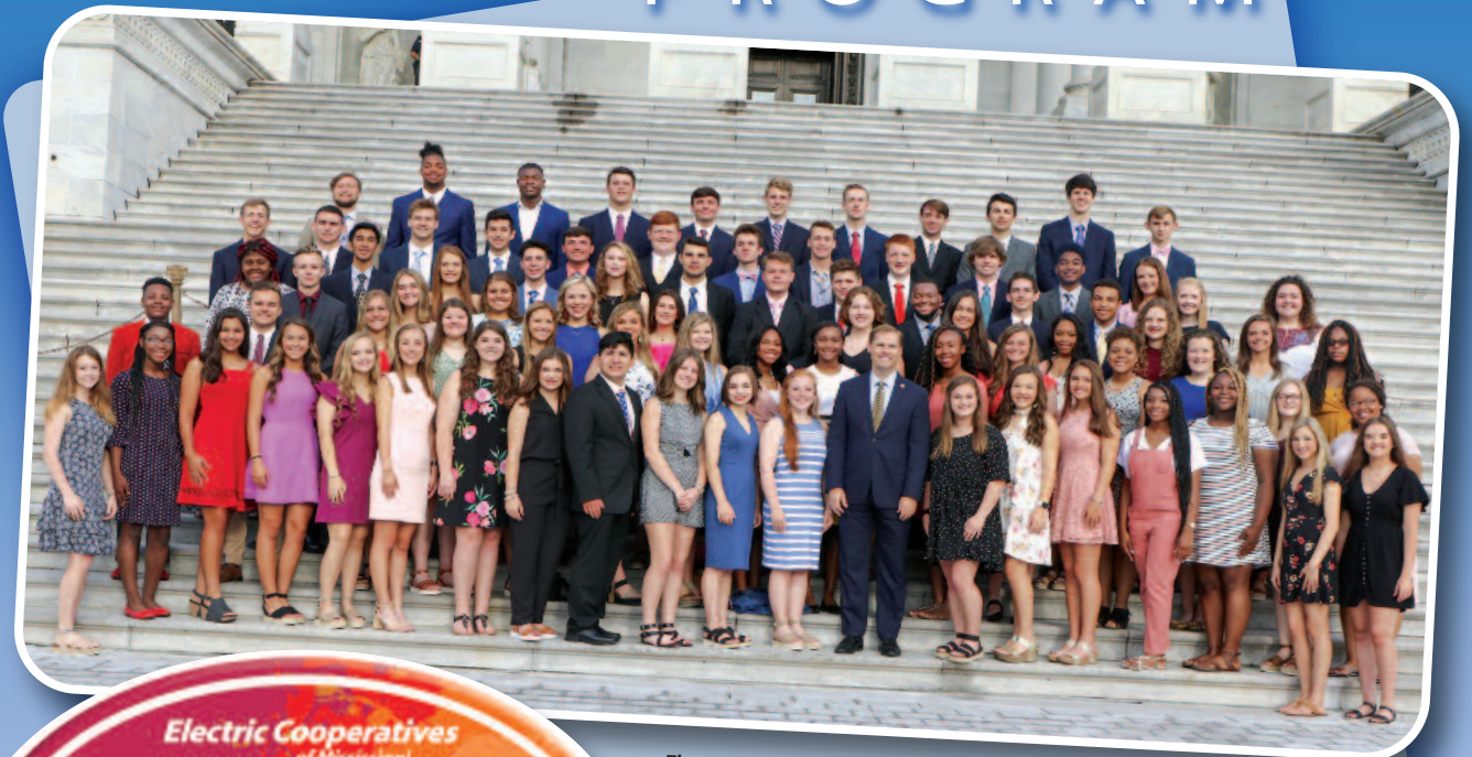
The 2019 participants with Rep. Michael Guest.