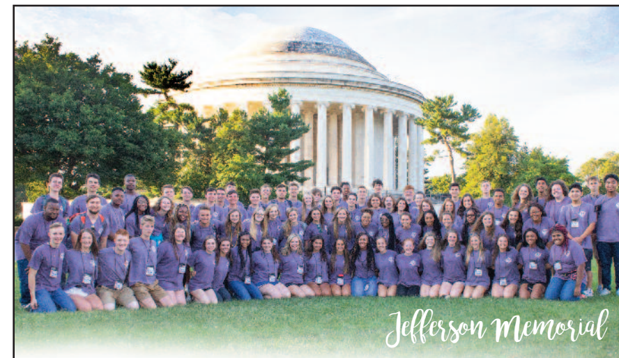
Sightseeing in Washington, D.C., included a stop at the Jefferson Memorial for these 2019 Youth Tour participants.

Each year Mississippi's student delegation joins more than 1,800 high school juniors from 43 states across the nation at the Youth Tour in Washington, D.C., where they learn about cooperatives and rural electrification from a national perspective.