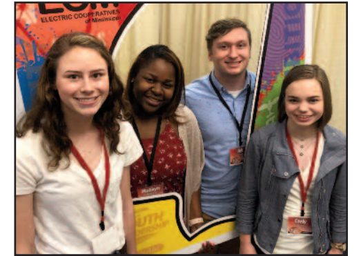
"Fun Time" at the workshop includes an ice cream social and photobooth time.

At the 2019 workshop, students heard presentations from Gov. Phil Bryant and Lt. Gov. Tate Reeves, as well as motivational speakers, and discussed issues in a mock town hall meeting. By participating in a fun team-building exercise conducted by a team of professional instructors, students gained unique insight into the value of working with others to achieve common goals.