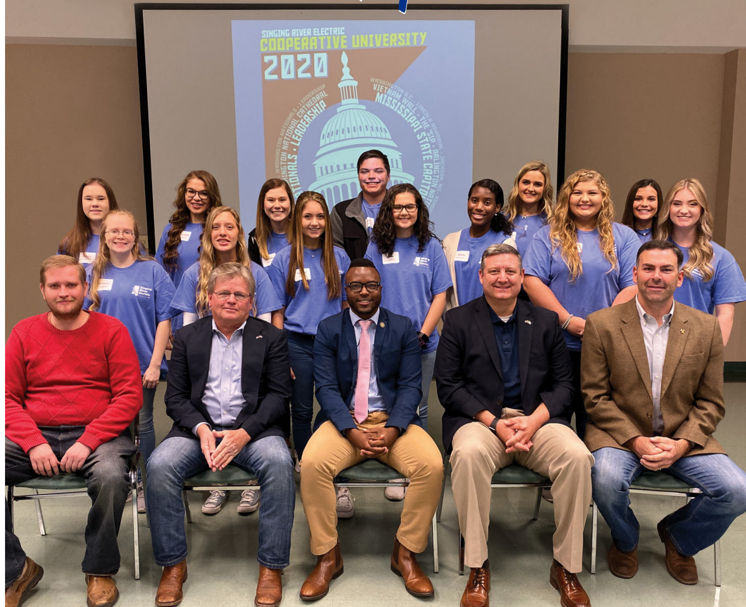
2020 Mississippi Youth Leadership Program

Singing River Electric hosted its Youth Leadership Program Cooperative University and interviews at the Lucedale office on November 14. Since 1988, Singing River Electric's goal for this program is to educate the future leaders of our communities about electric cooperatives and introduce them to their government in action.