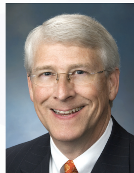
ROGER WICKER United States Senator