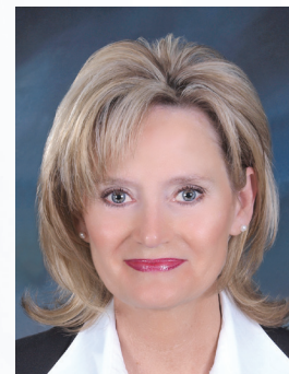
CINDY HYDE-SMITH United States Senator