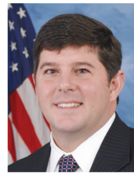
STEVEN PALAZZO United States Representative Fourth District