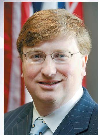
TATE REEVES Governor