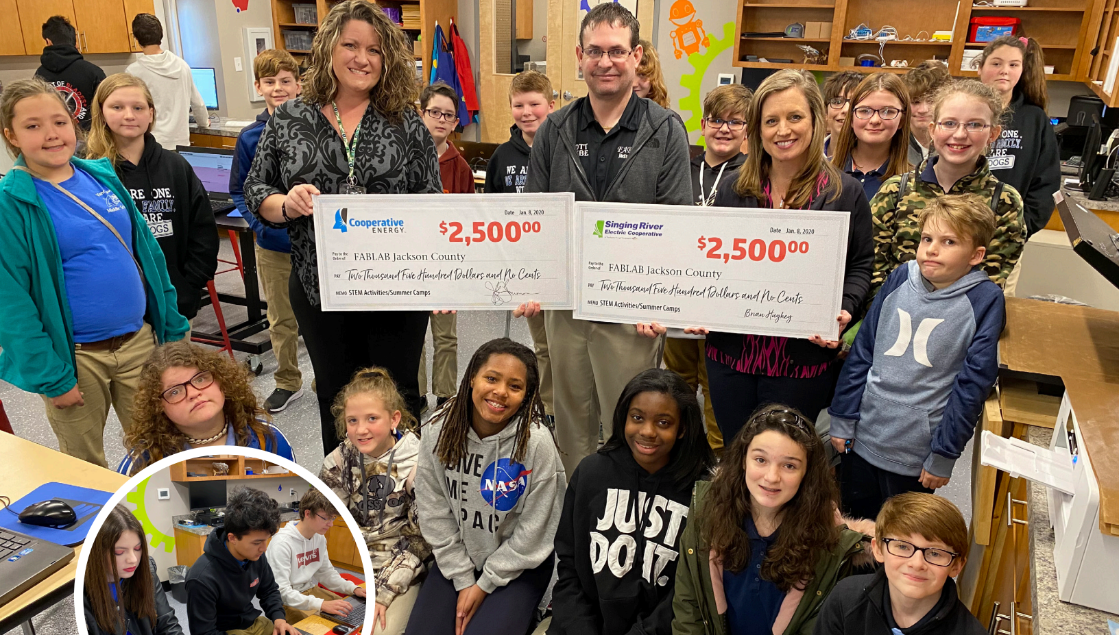
FABLAB Jackson County