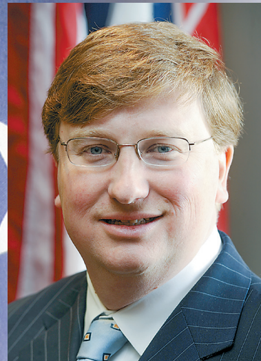
TATE REEVES Governor