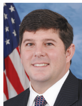
STEVEN PALAZZO United States Representative Fourth District