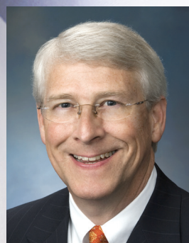
ROGER WICKER United States Senator