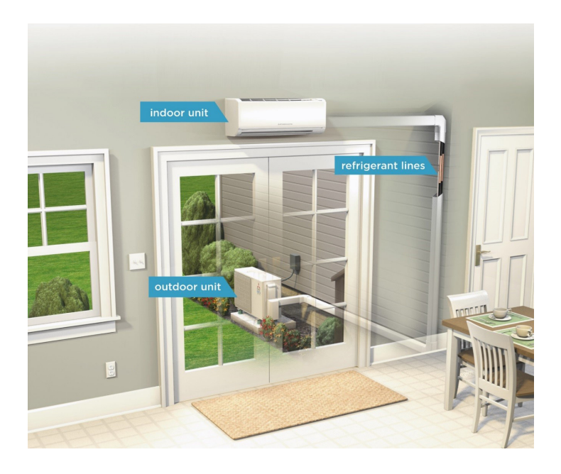
Figure 1. Ductless Mini Split Heat Pump Installed

Ductless heat pumps, or mini split heat pumps, are an alternative to radiator or baseboard heating, as well as a replacement for window units for cooling. No duct work is needed. Instead, a head unit, or multiple head units, are mounted on an interior wall or ceiling, with an accompanying unit outside (Figure 1). The outside unit extracts heat from the air, even when it's cold. Refrigerant carries the heat directly to the head(s) inside, which then delivers heated air to occupied space. In warmer months, the system works in reverse for quiet, efficient air conditioning.