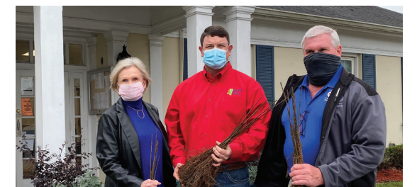
City of Ocean Springs

T rees work as windbreaks, prevent soil erosion and provide shade, building materials and more. Arbor Day is a celebration of these majestic tall plants and is observed to promote education, conservation and planting of trees across the nation. Mississippi adopted Arbor Day as the second Friday in February in 1926. The national holiday is the last Friday in April, but Mississippi chose its day to coincide with the best tree planting weather in the southeast region.