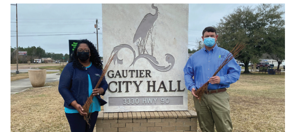
City of Gautier