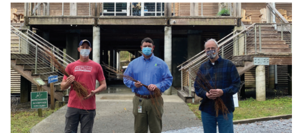
Pascagoula River Audubon Center

SRE donates hardwood bareroot seedlings locally as part of Miss. Arbor Day activities.