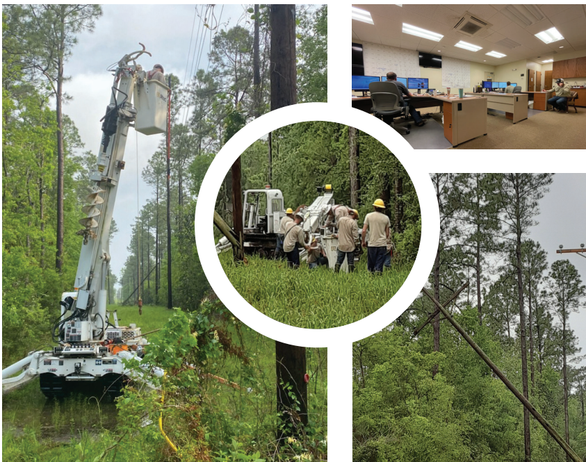
SRE crews respond to weather-related power outages and flooding throughout Jackson County.