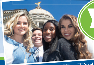
2020 SRE representatatives visited the Mississippi State Capitol.