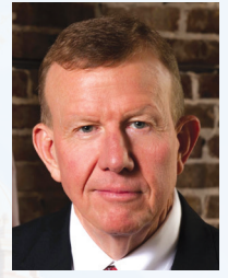
MIKE EZELL United States Representative Fourth District