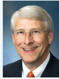
ROGER WICKER United States Senator