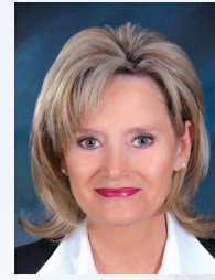
CINDY HYDE-SMITH United States Senator