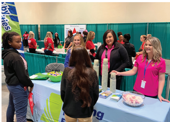
Inside the Energy Pathway, students learned about the importance of customer service through interactive role-play, had their picture made from inside a lineman's bucket, and experienced climbing a pole in a lineman's gear.