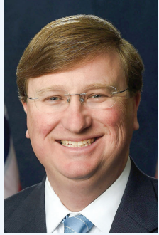
TATE REEVES Governor

Singing River Electric salutes Mississippi's senators and representatives who represent our state in Washington, D.C., and at our state capital in Jackson. We appreciate their dedication and willingness to serve in the spirit of public service to help shape the future of our state.