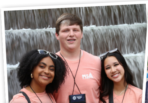
SUNDAY, JUNE 16 FDR MEMORIAL

The Cooperative Youth Leaders program is fully funded — including the trip to D.C. — by the local electric co-ops as a commitment to molding future leaders for Mississippi, so they can impact the state and local communities.