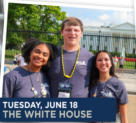
TUESDAY, JUNE 18 THE WHITE HOUSE