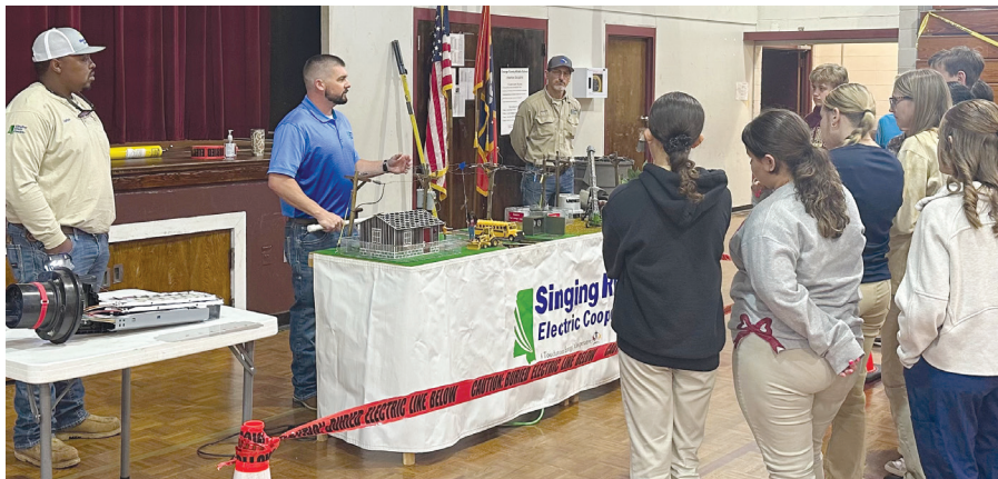
Singing River Electric employees recently attended George County Middle School's Farm Safety Day and demonstrated the do's and don'ts of electrical and fiber safety.

Singing River Electric is your source for power and information. We partner with our local schools for safety education and provide online resources for you and your family. Take advantage of all the safety resources on our website at singingriver.com/electric-safety .