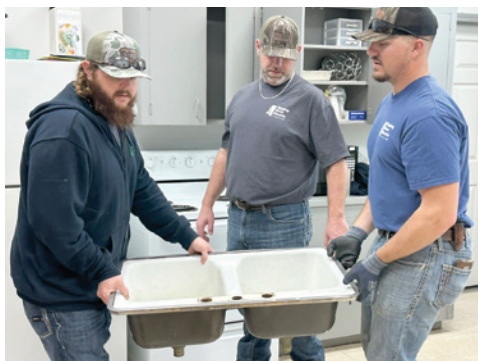
Sand Hill Attendance Center