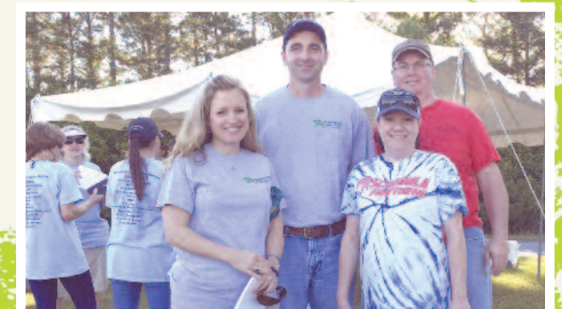
SRE employees volunteered at the 2016 Jackson County Household Hazardous Waste Collection Day, Gautier (April 2016)