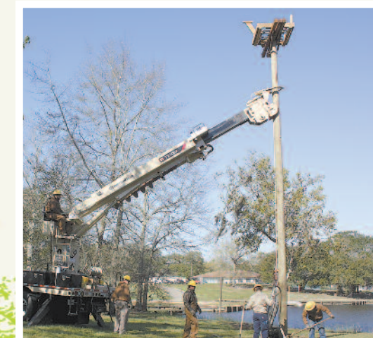
SRE crew installs Osprey Nest at Indian Point in Gautier (March 2017)