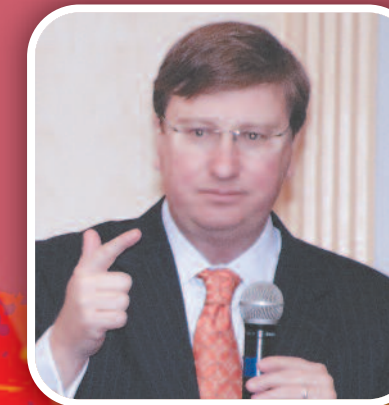
Lt. Gov. Tate Reeves