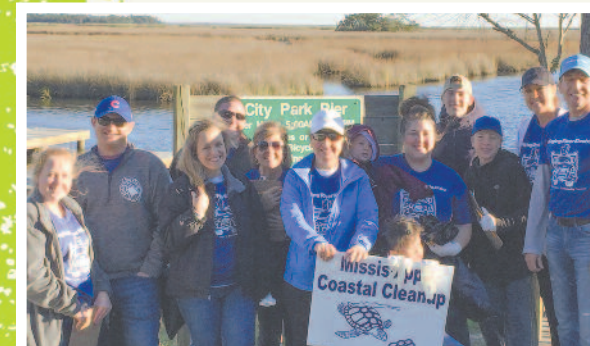
SRE employees donate their time at the Mississippi Coastal Cleanup at Gautier City Park and Pier (October 2016)