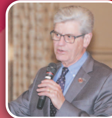
Gov. Phil Bryant