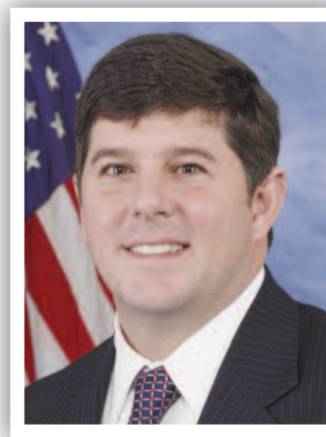
STEVEN PALAZZO United States Representative Fourth District