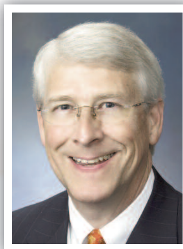
ROGER WICKER United States Senator