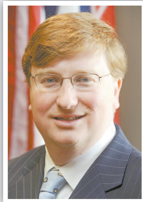
TATE REEVES Lieutenant Governor