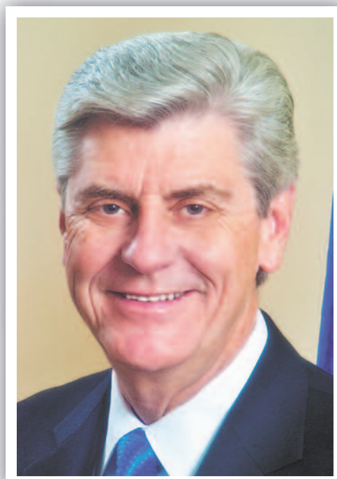
PHIL BRYANT Governor

We are proud to present these members of the 2017 Legislative roster as a tribute to Mississippi's elected officials who serve electric cooperative members and all Mississippians.