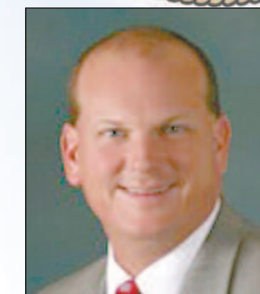
Sen. Brice Wiggins District 52: Jackson County Address: P.O. Box 922 Pascagoula, MS 39568 Years in Legislature: 6