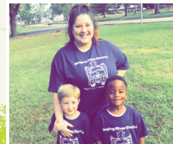
SRE employees donate their time at the Mississippi Coastal Cleanup at Gautier City Park and Pier.