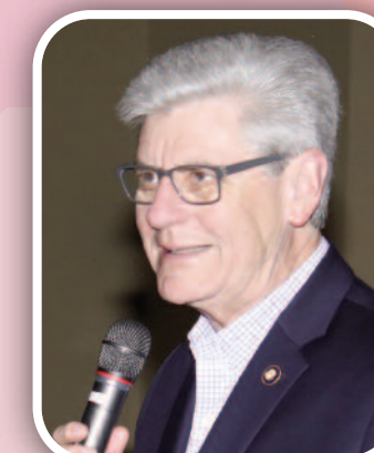
Gov. Phil Bryant