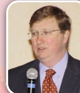
Lt. Gov. Tate Reeves