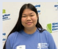
Phi Ta Resurrection Catholic High School